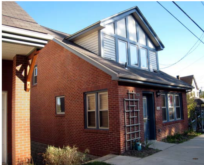
Completed Rehab Unit