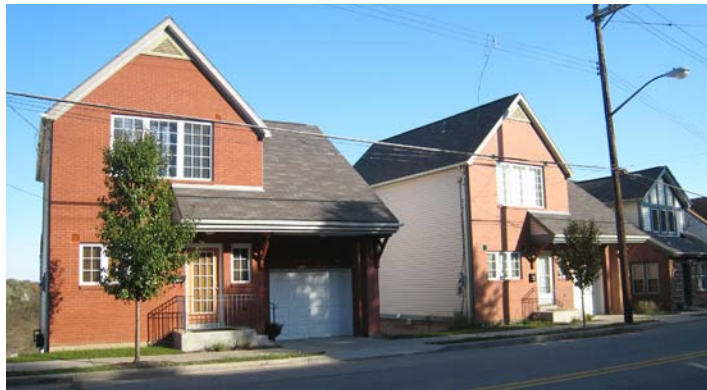
Hillside New Units