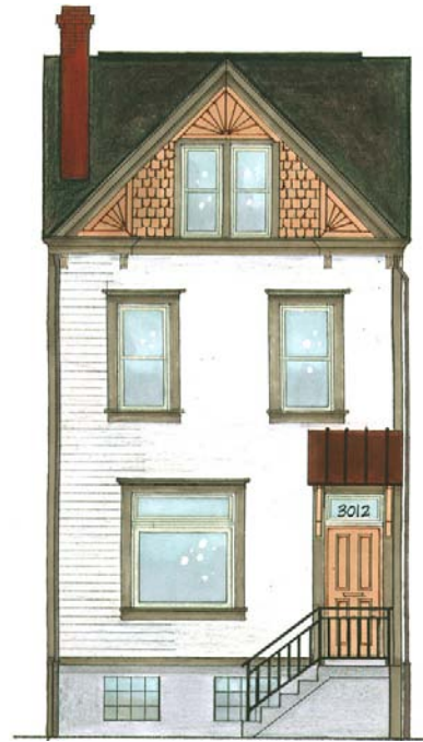
Rehab Unit Sample