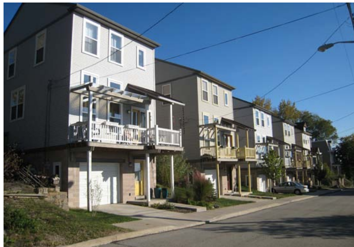
Completed Uphill Units