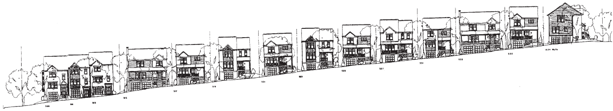
ARTHUR STREET ELEVATION