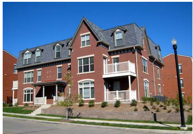
9 unit building with accessible units on 1st floor