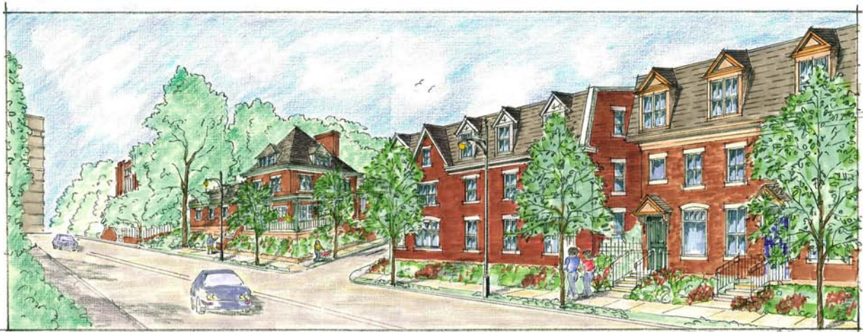
view down Bedford Avenue