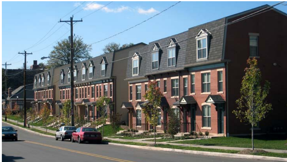
Phase II view on Bedford Avenue

Bedford Neighborhood, Hill District Pittsburgh, PA • 2008