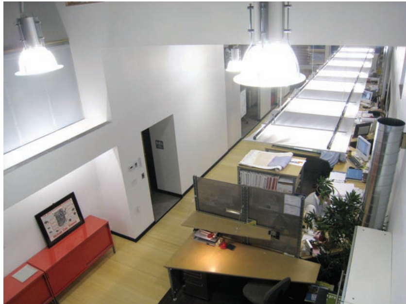
view from loft

Specific features include high-efficiency closed-cell foam spray insulation, Energy Star Firestone TPO roofing, high-performance glazing with a cooling index of 1.89, ultra-efficient gas boiler with indirect-fired water heater, radiant floor heating, VRFZ heat pump system with R410a refrigerant distributing conditioned air through swirl floor diffusers linked to an energy recovery ventilator for outdoor air and high-efficiency T5 and LED lighting.