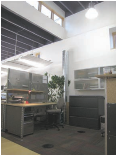
view of front office area

Given the long N-S aspect ratio, several design strategies were implemented: creating linear served- and servant-spaces articulated through the plan geometry and the use of materials in addition to creating a large glazed opening in the southern facade, re-glazing existing openings in the western facade and incorporating a south-facing clerestory for daylight and natural ventilation.