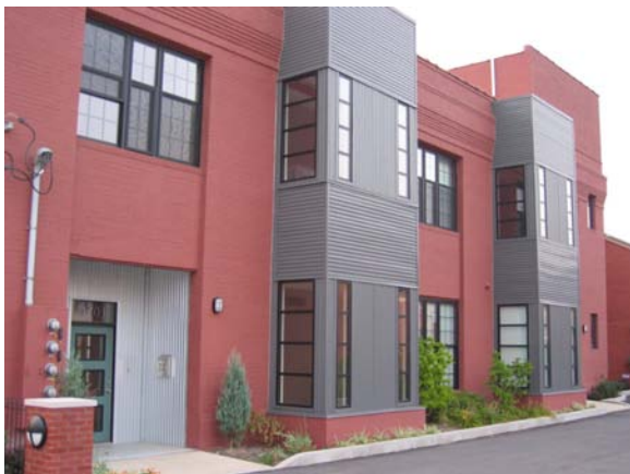
View towards unit entrance