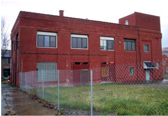
View prior to renovation